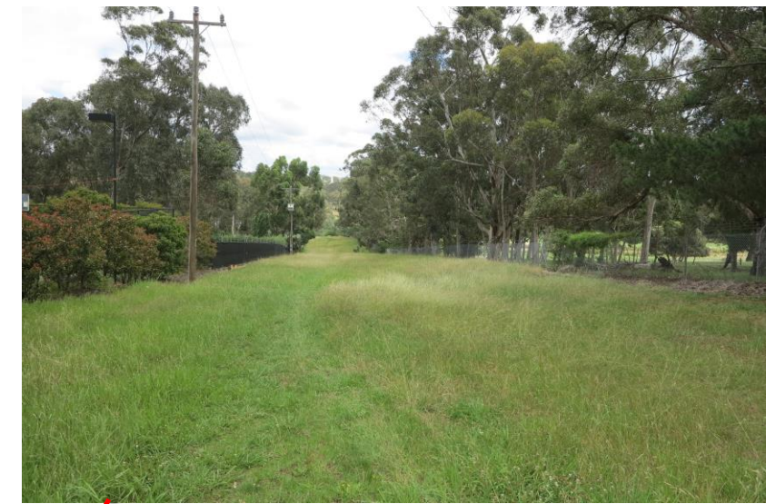
View looking west from B