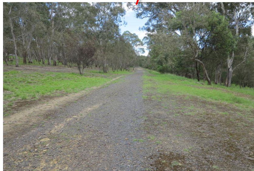
View looking west from D