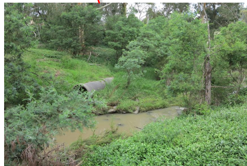
Proposed Creek Crossing location at C