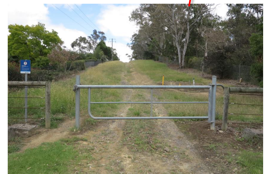
View looking west from A