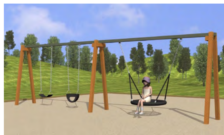
2. TRIPLE SWING SET