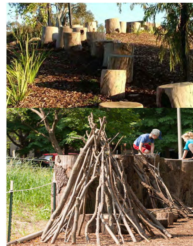
5. LOG STEPPERS & CUBBY