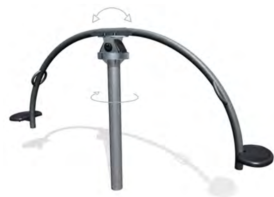
1. HIP HOP