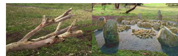
4. LOG BALANCE & ROCKS