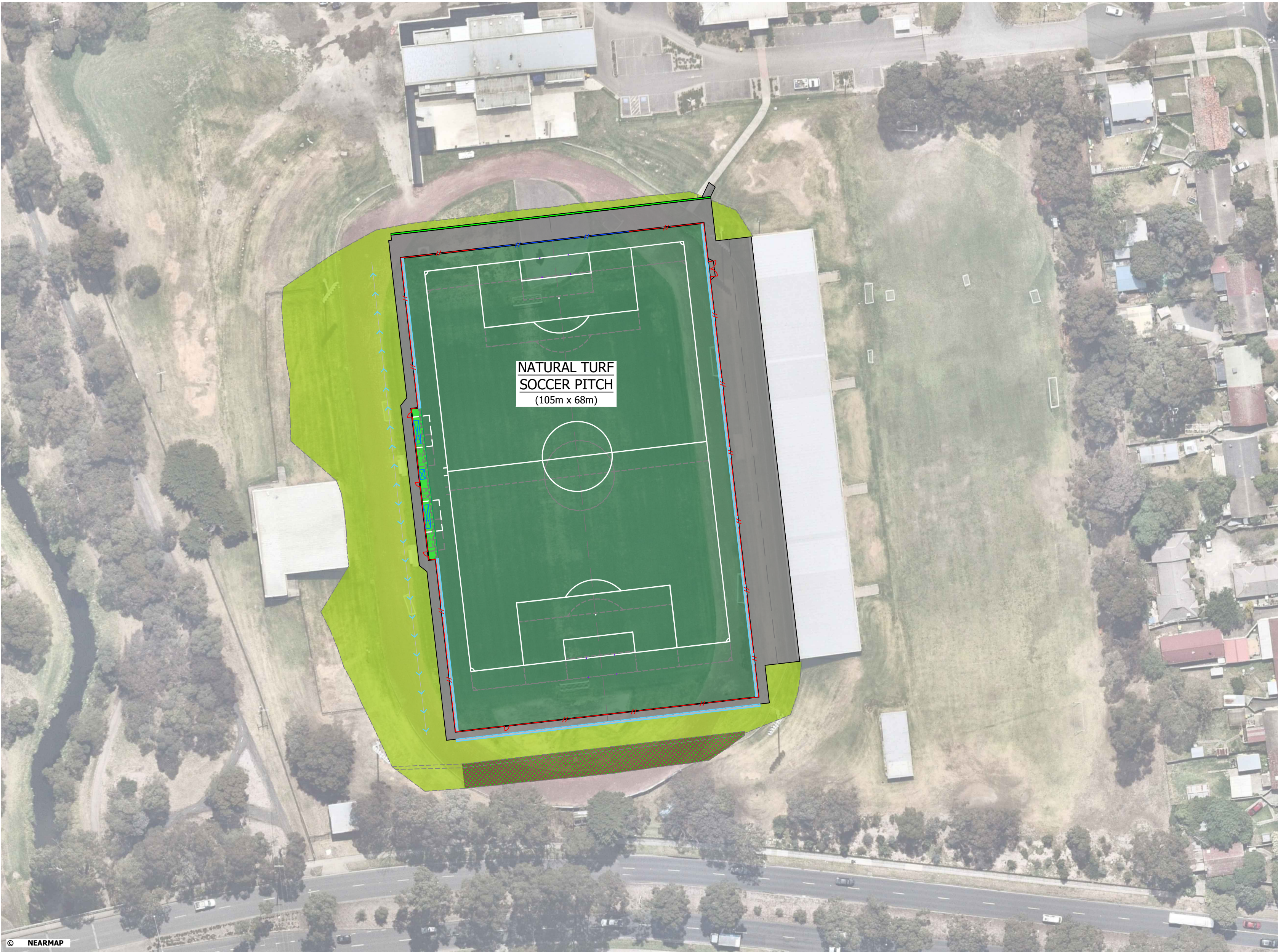
OVERALL SITE LAYOUT PLAN ALL AERIAL IMAGERY USED IN THE PRODUCTION OF THIS DRAWING SET HAVE BEEN UNDER LICENSE FROM NEARMAP.