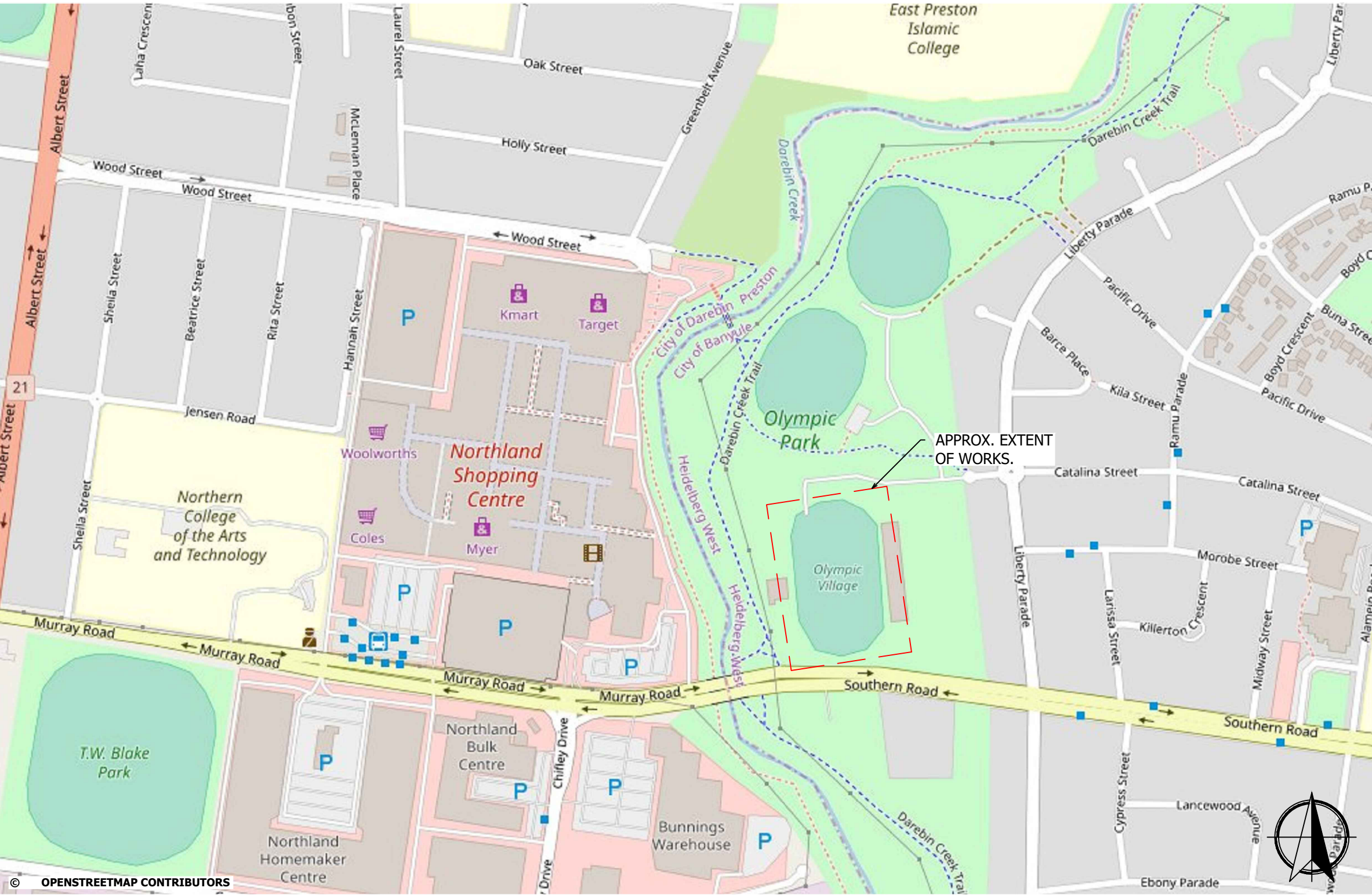
LOCALITY PLAN - LIBERTY PARADE HEIDELBERG WEST 3081