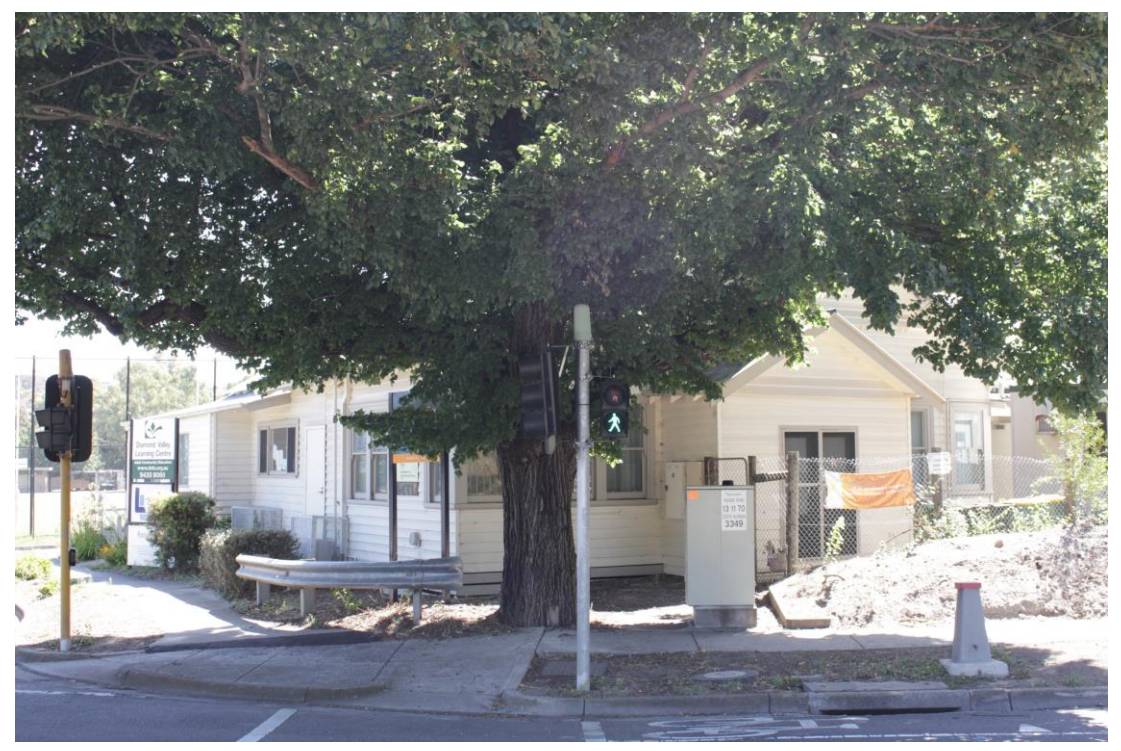
English elm, south of the porch

The pair of English elms (both likely Ulmus procera ) situated either side of the north elevation are mature specimens that were likely purposefully planted to enhance the aesthetic of the entrance to the building.