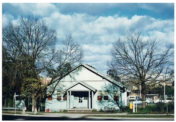
Photograph of the Greensborough Park Tearooms from Diamond Valley Creek Road, in 1978, prior to additions