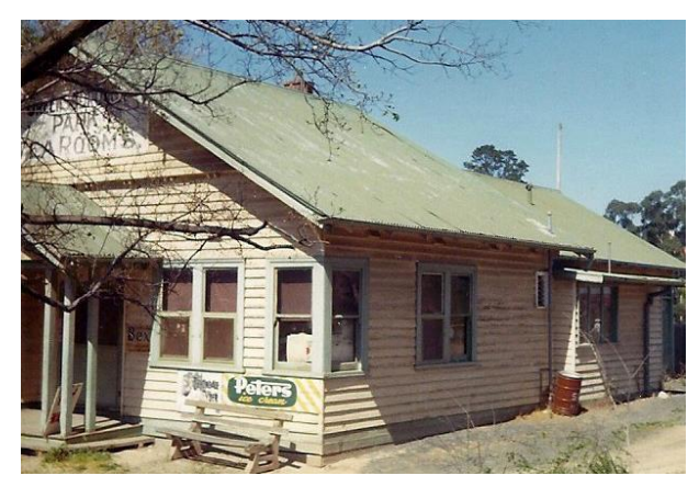
Photograph of the façade (left of frame) and northern elevation in the early 1960s