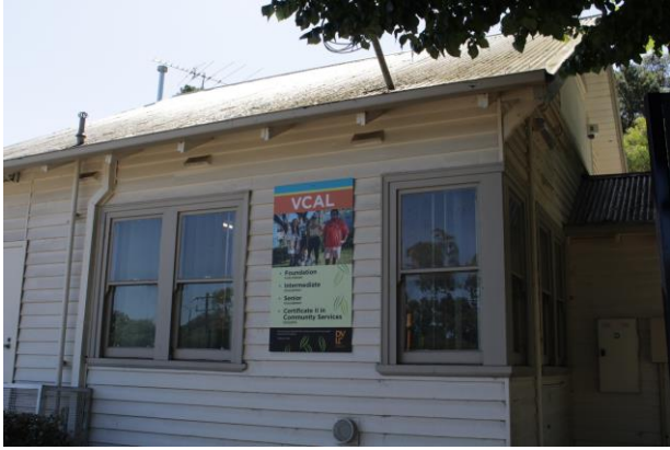
Original fenestration, note 'corner' window

The building is timber-framed and clad in painted weatherboard. Based on historical photographs, the colour scheme has always been light (possibly cream with detail picked out in earthy hues), as it remains.