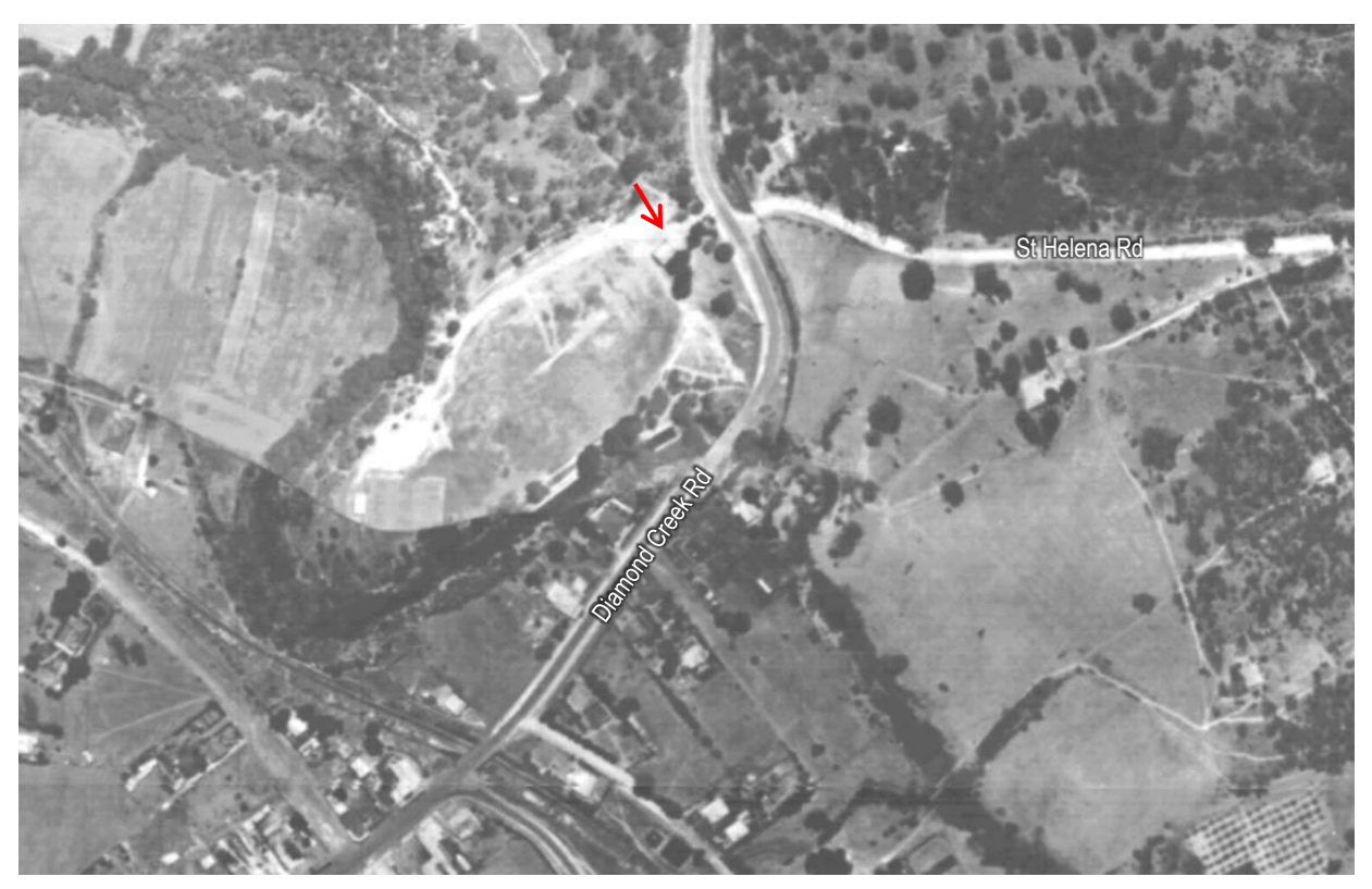
1945 aerial photograph with the subject building identified by the red arrow – note Diamond Creek Road has been re-aligned

The Lobb family lived at the site into the late 1960s.<sup>30</sup> Their presence gave rise to its designation as 'Lobb's Tearooms', although photographs dating from their tenure show the retention of 'Greensborough Park Tearooms' to the front signage panel. Lobb's Tearooms, however, appears to remain favoured locally in references to the place.