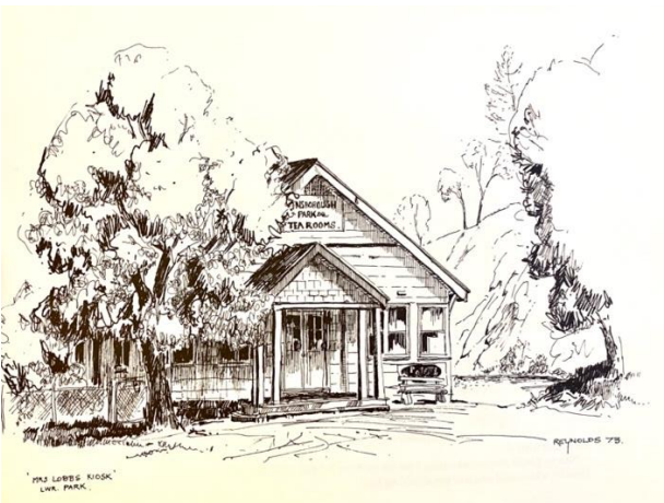
1973 sketch by Roy Reynolds, inscription: 'Mrs Lobbs Kiosk, Lwr. Park' (Source: Turvey, Greensborough and Greenhills)

Beyond representing a shift in the public consumption of food and drink, tearooms were also considered 'decent' venues that, due to their associations with domesticity and even femininity (strong counterpoints to the masculine drinking culture of public houses), offered a rare social sphere for women to interact and engage freely. As reflected in the number of known female operators and proprietors at the place, tearooms were also – in the highly gendered domain of the early 20<sup>th</sup>-century business world – one of the few 'respectable' enterprises that women could run. The presence of interwar businesswomen runs counter to the dominant interpretation of women in the period as constrained to the private realm, focused on charitable activities or forced into lower-order work, such as domestic service and factories.