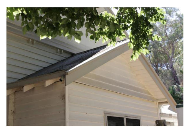
The gable end and roof form of the porch are likely original

This central gabled porch defines the symmetrical façade and operated as the public entrance to the tearooms. It was previously open and characterised by two groups of paired timber square posts, a low waisted timber/glazed door bordered by high waisted sidelights and raised deck. In recent times, the porch has been enclosed with weatherboarding and no longer functions as an entry. The weatherboard finish with a central notched band to the porch's gable end is likely original.