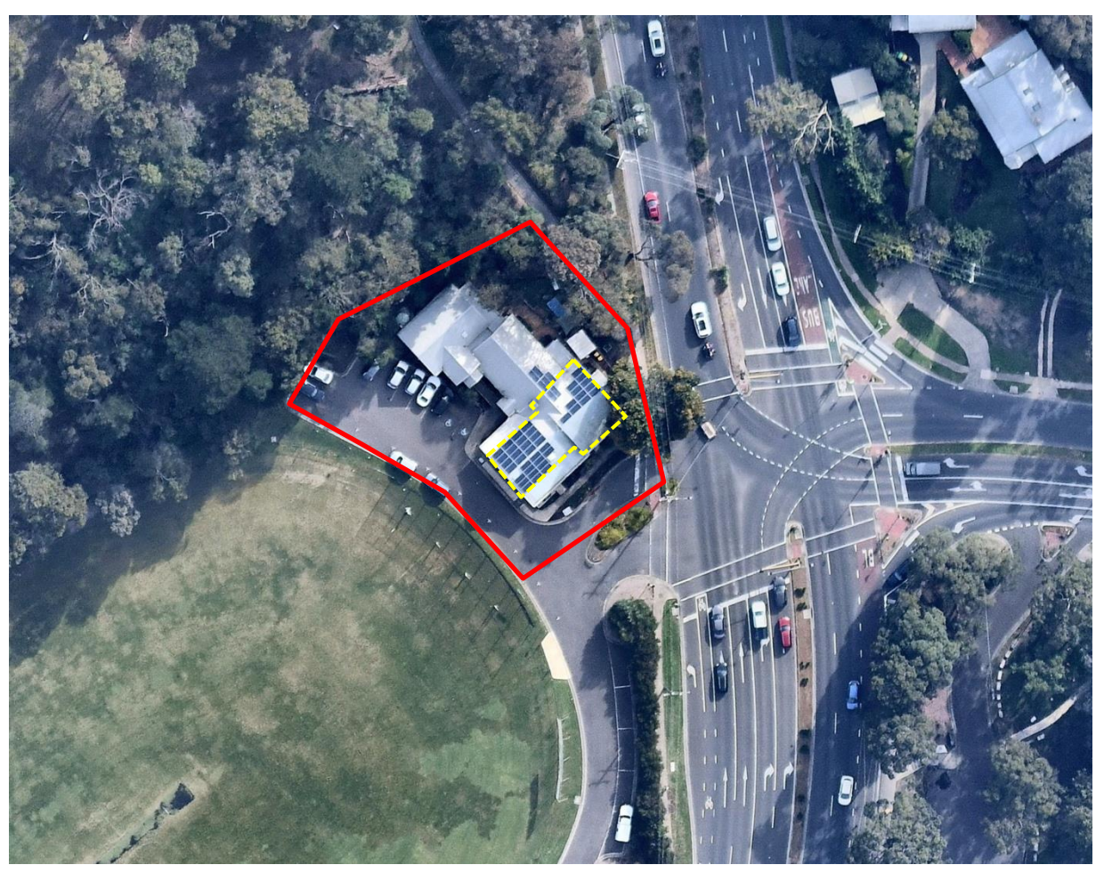
Recommended extent of heritage overlay The original extent of the interior building is approximately outlined in dashed yellow

The proposed extent of the heritage overlay is outlined approximately below.