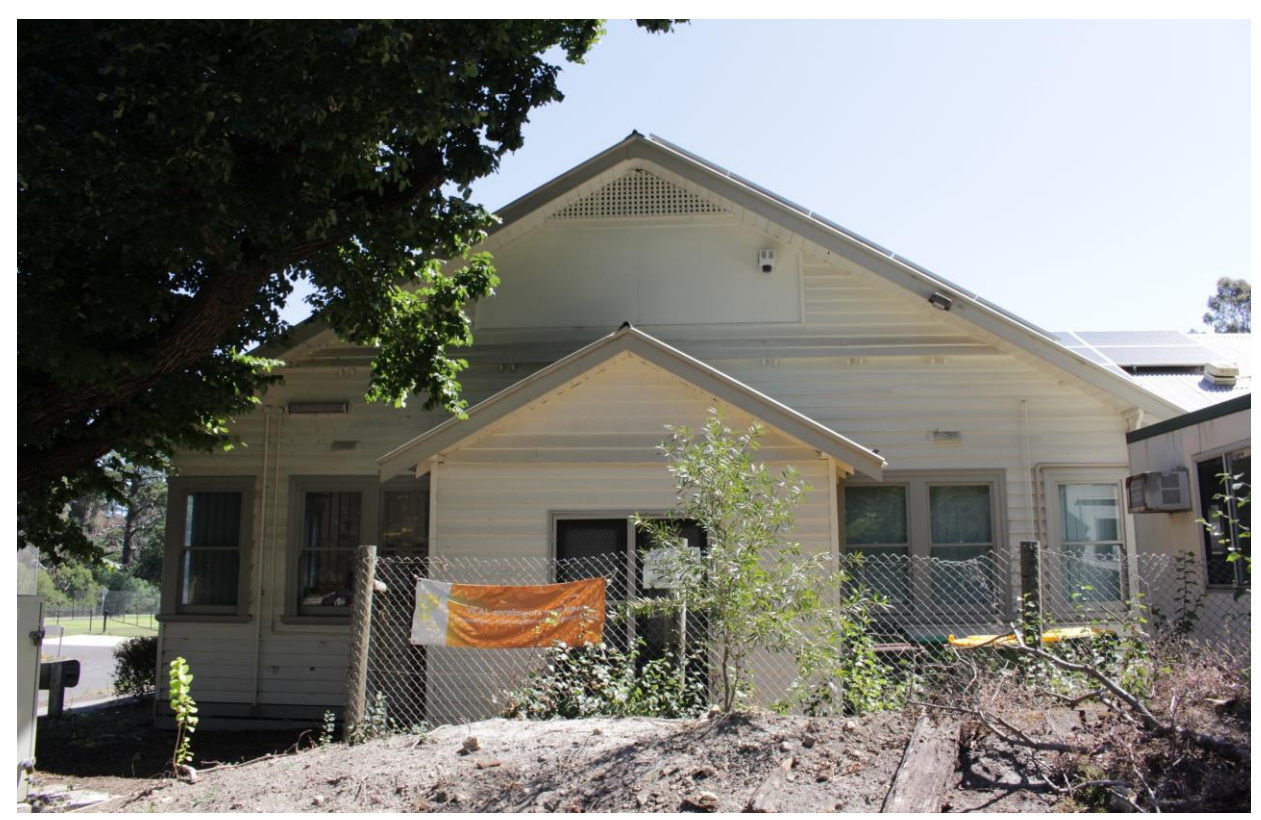
1925 façade - note distinctive fenestration and retention of signage panel

Lobb's Tearooms (former) and DVLC is situated on the eastern boundary of Greensborough Park, between the oval and Diamond Creek Road.