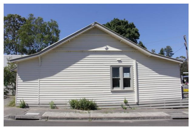
Eastern elevation - note the skillion-roofed extension, left of frame