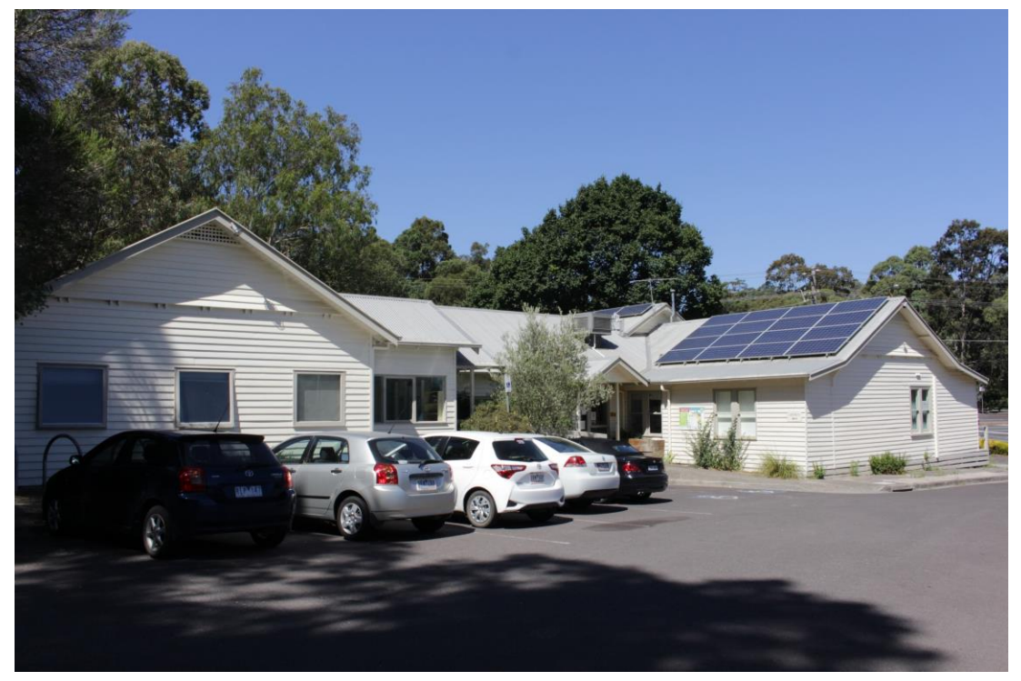
View to later additions from the rear carpark – the former tearoom is situated right of frame

Attached to the west elevation of the 1925 section of the building are two interconnected gable-roofed weatherboard wings, which were added during the late 20th-century. Their detailing (gable ends, porches, windows, rafter ends) largely mimic the former tearoom, while their siting allows for the legibility of the former tearoom to remain interpretable. A bitumen finished driveway and car parking edge the building to its east and south.