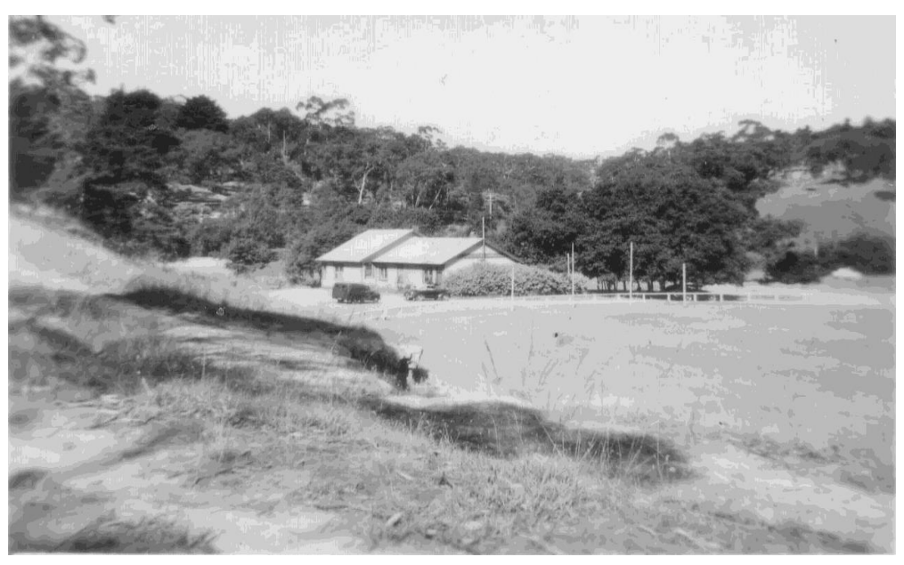
1950s photograph of the rear of the Greensborough Park Tearooms, looking north across the oval