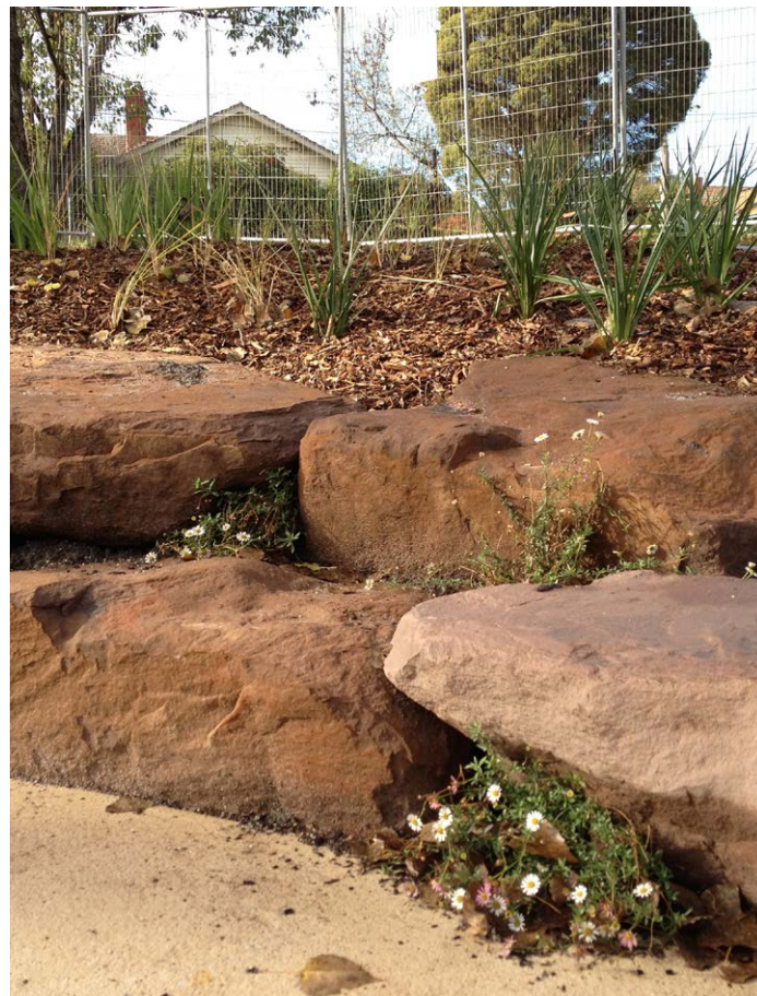
14.7 Mudstone boulder edging