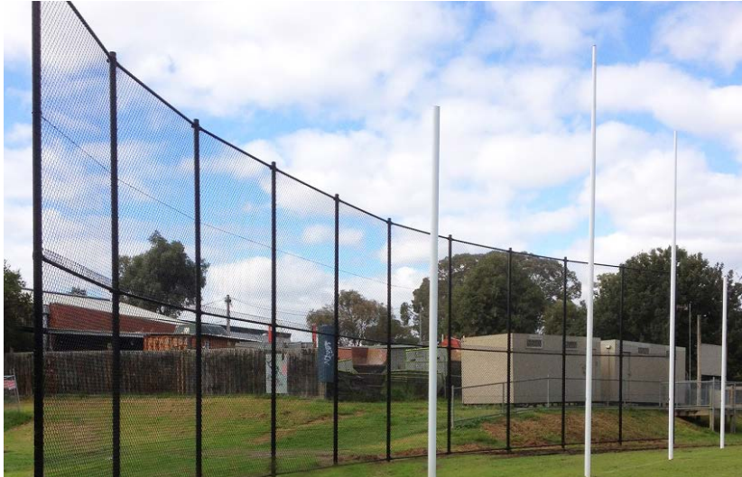
12 Ball Catch Fence Behind Goals