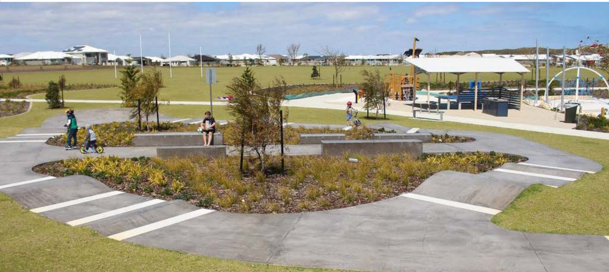
3 2.5m wide concrete learn to ride and scoot track with linemarking, humps, banked corners and low concrete upstand walls/seats for intermediate skaters.