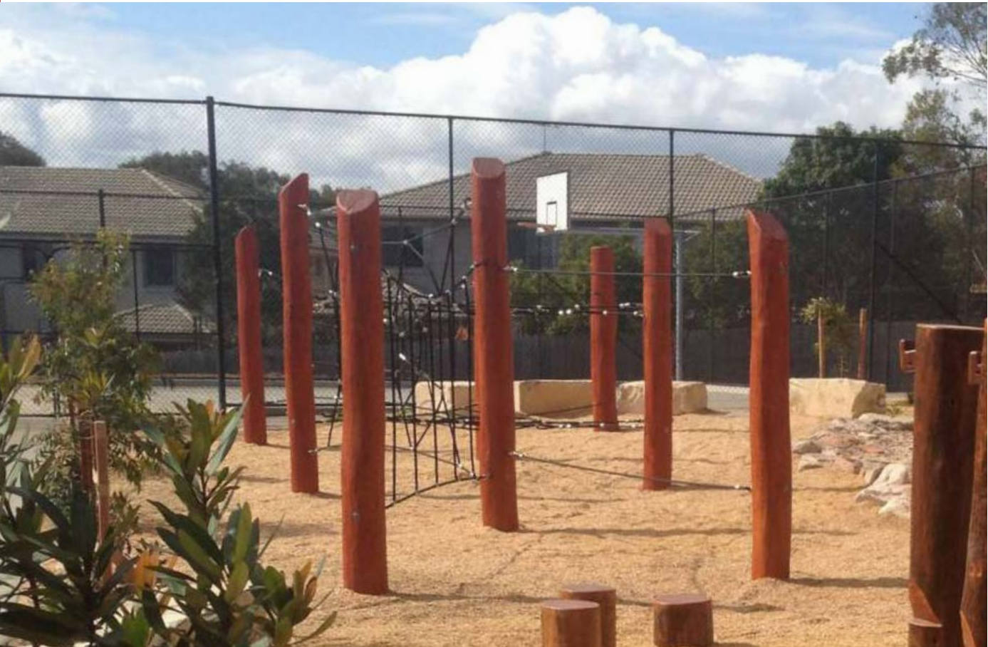
14.2 Timber Rope Climber