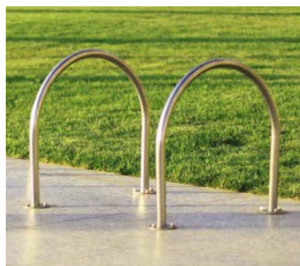
11 Example of stainless steel bike rails.

This drawing and design is subject to copyright and may not be reproduced without prior written consent. Contractor to verify all dimensions on site before commencing work.