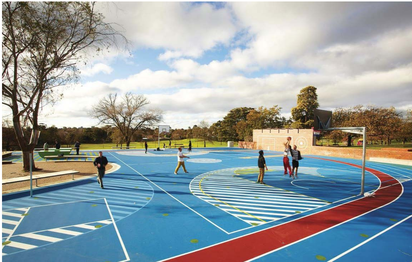
2 Plexipave multipurpose court with full-sized basketball and futsal courts and four square linemarking