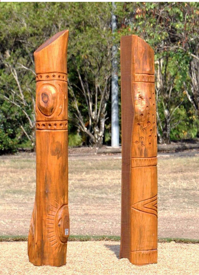
14.4 Doorway Climb