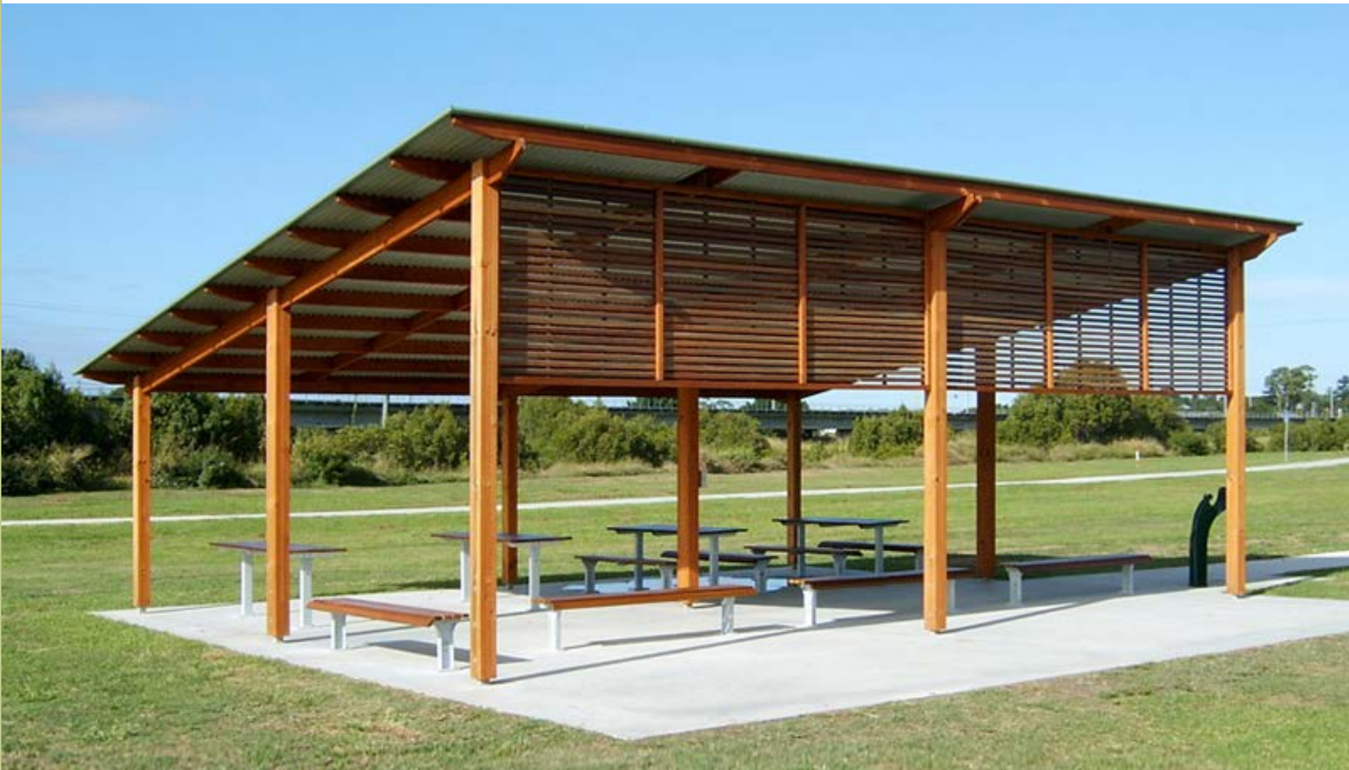
8 Picnic Areas 1 and 2 including shelters by accessible picnic settings, barbecues, drink fountains and litter bins (pictured below).