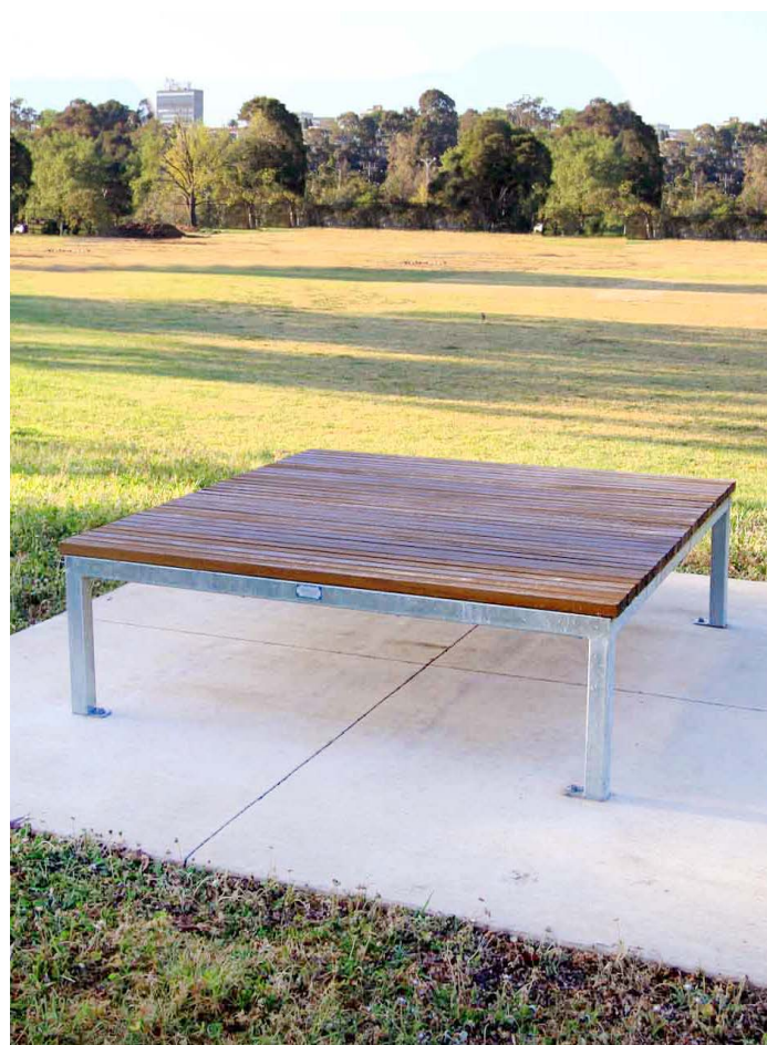
14.10 Example of Platform Bench