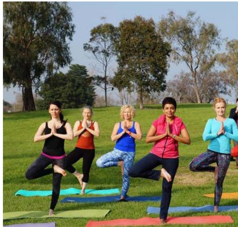
7 Well maintained grass surface for park fitness classes e.g. Yoga or Tai Chi