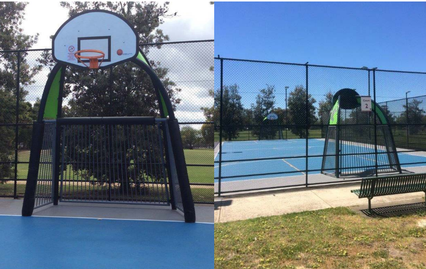
1 Combination futsal and basketball goal with barrier fence set back from court base line.