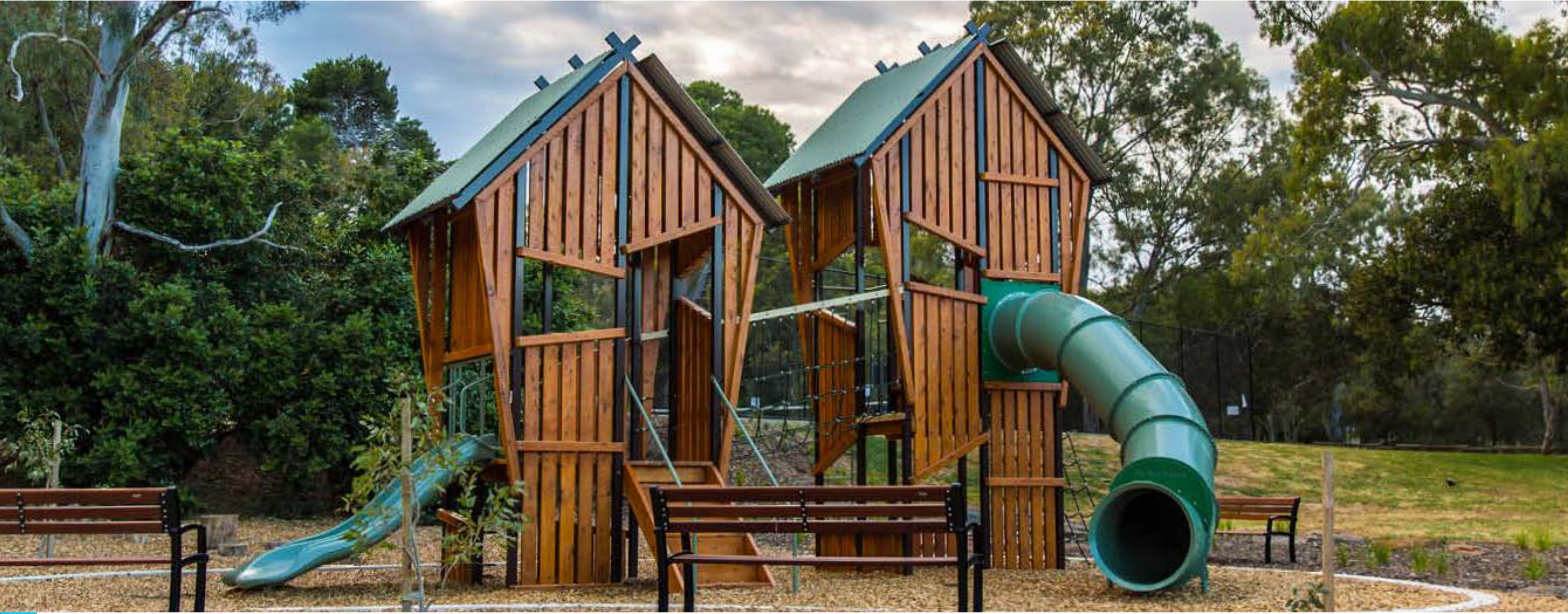
14.1 Cubby House Combination Unit