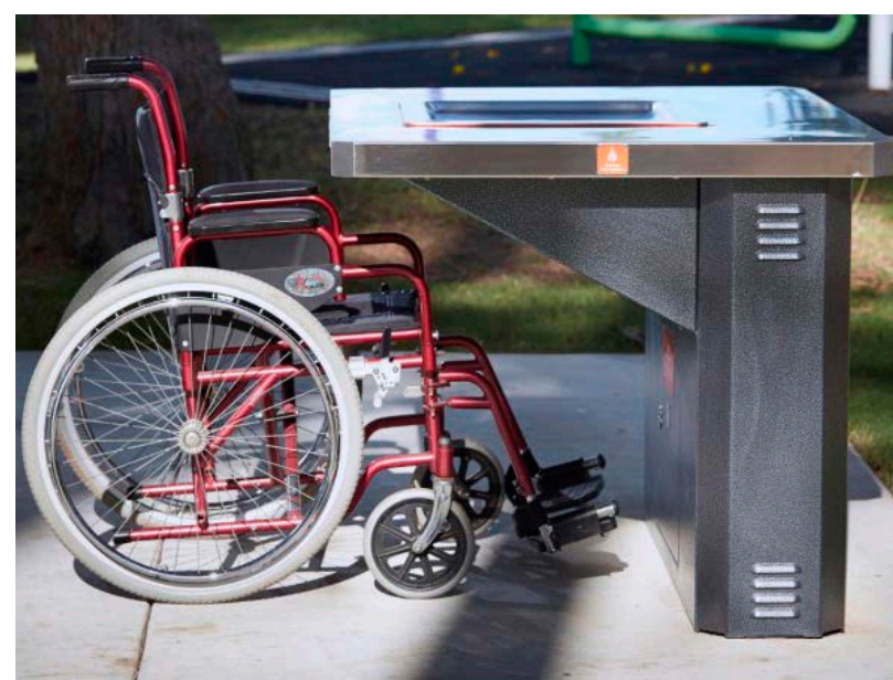
8 Example of accessible barbecue.