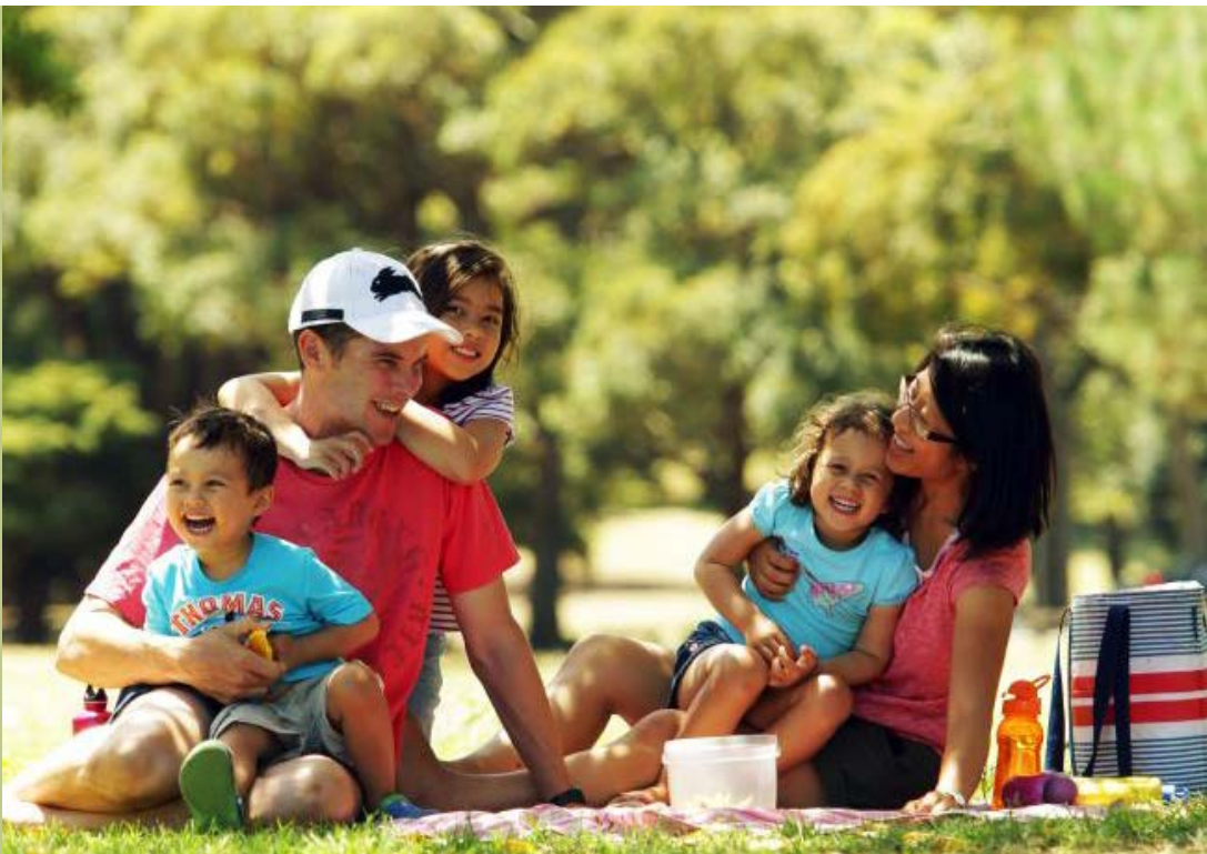
7 Irrigated lawn providing a well maintained grass surface for picnics, social gatherings and events.