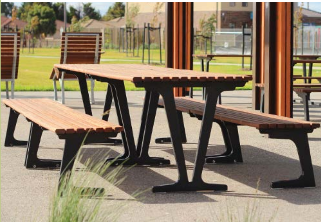
8 Example of wheelchair accessible picnic settings.