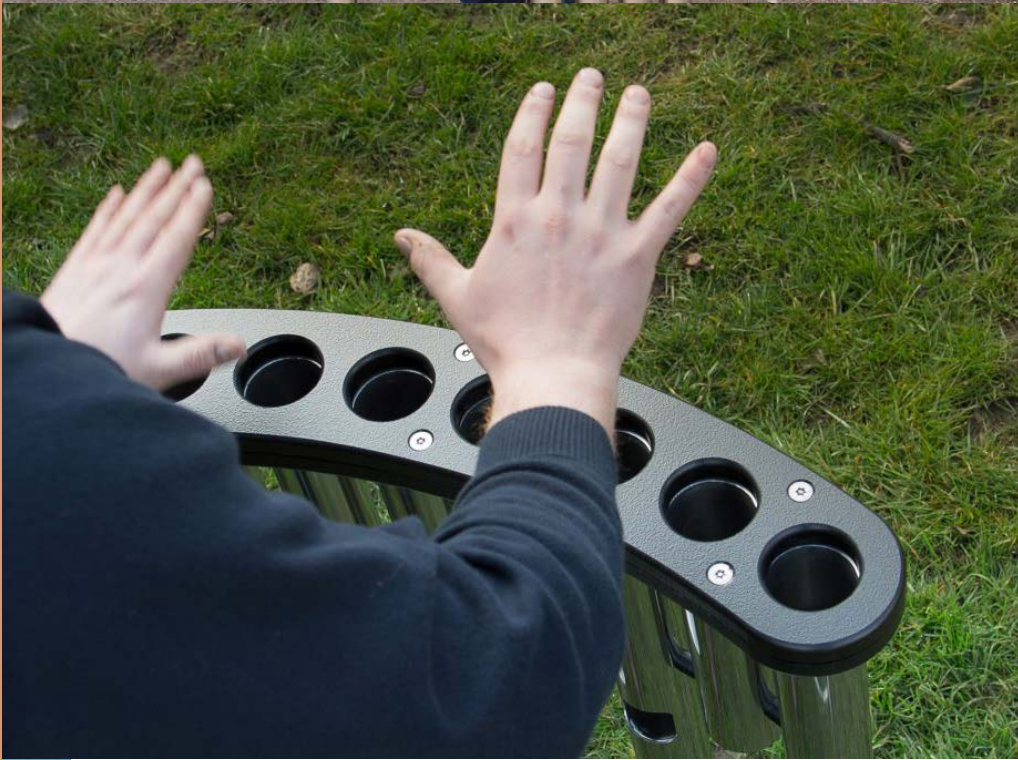
14.13 Example of Handpipes play item