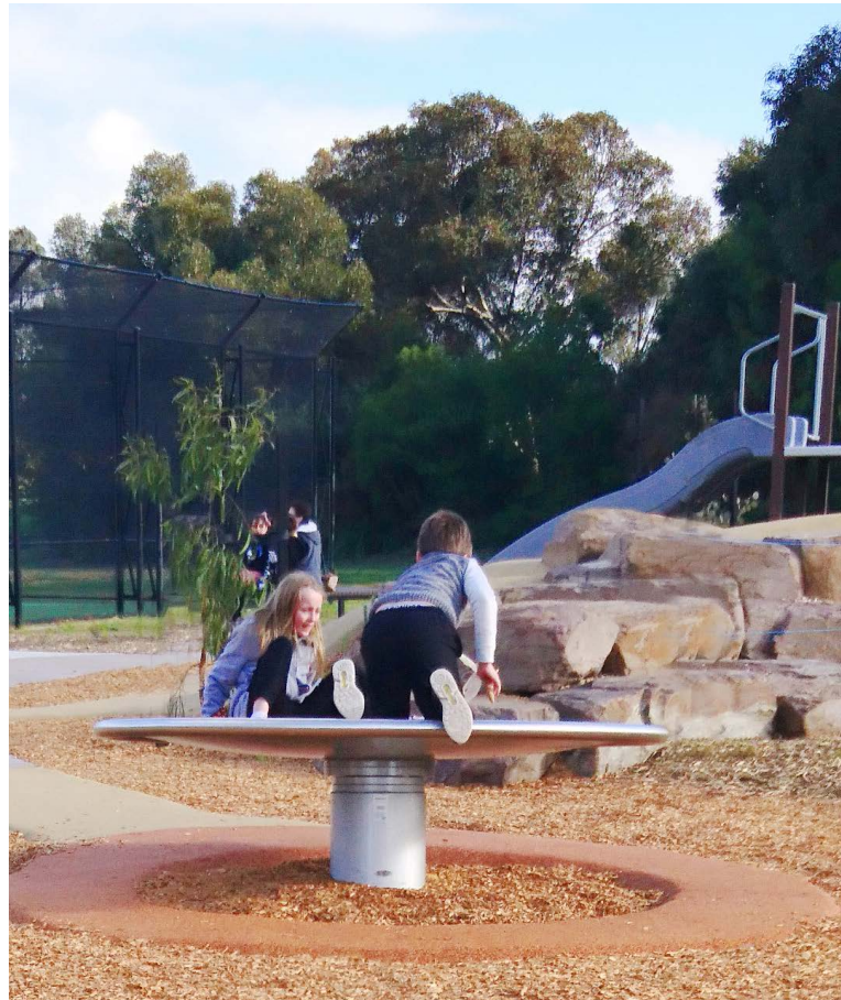
14.3 2.1m diameter Carousel