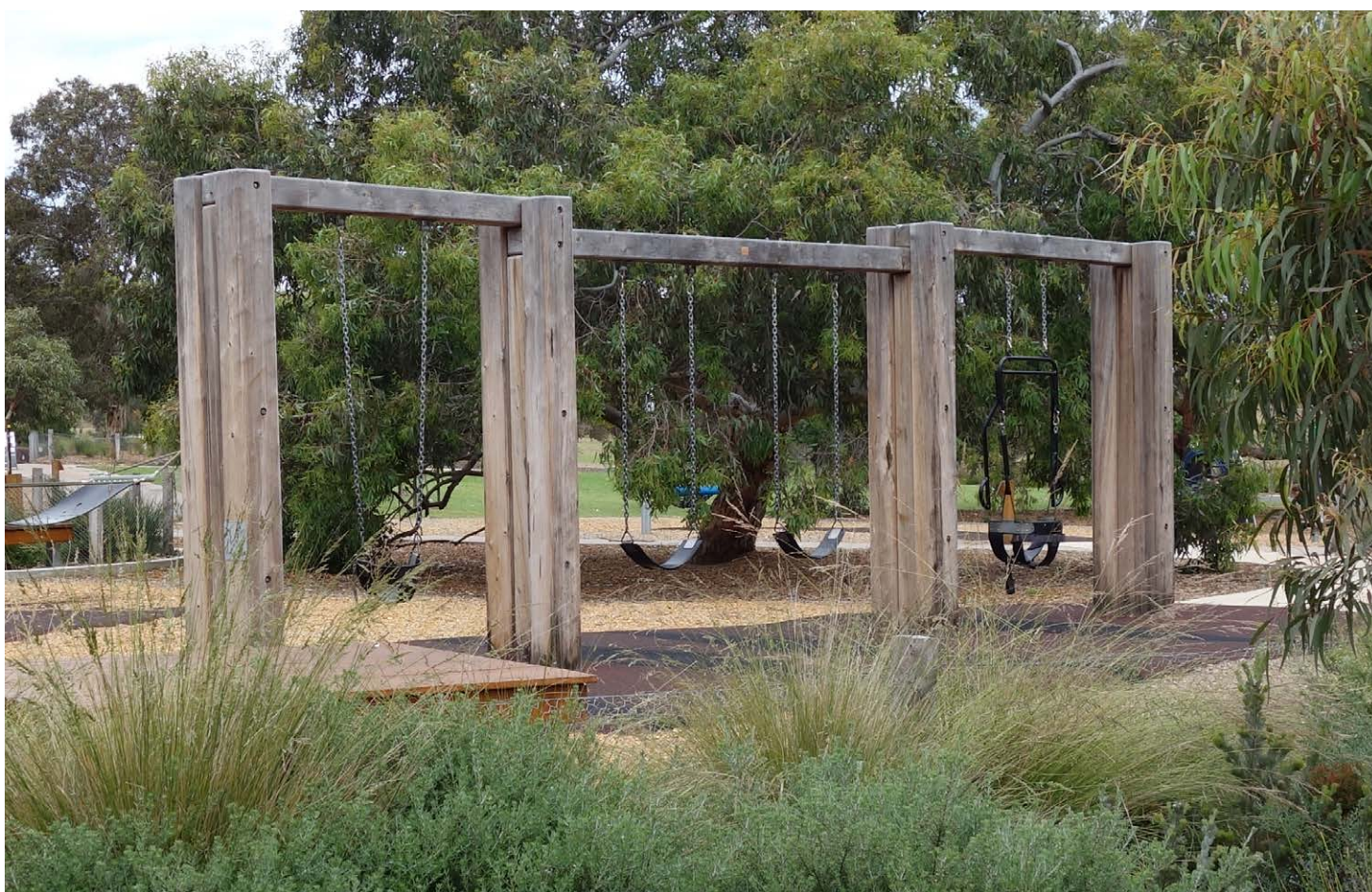
14.9 Four Seat Swing with 1 x accessible seat, 2 x sling swings and 1 x Joey Swing Seat.