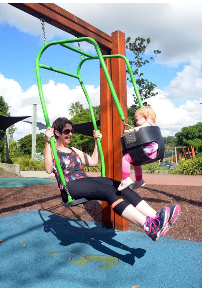
14.8 Joey Swing Seat