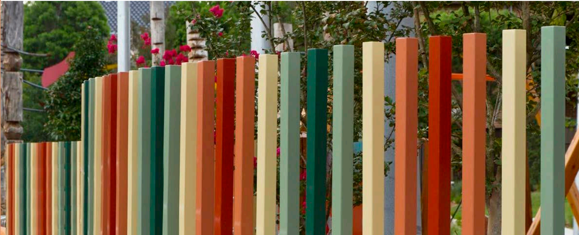
14.15 Example of Feature Coloured Fence

This drawing and design is subject to copyright and may not be reproduced without prior written consent. Contractor to verify all dimensions on site before commencing work.