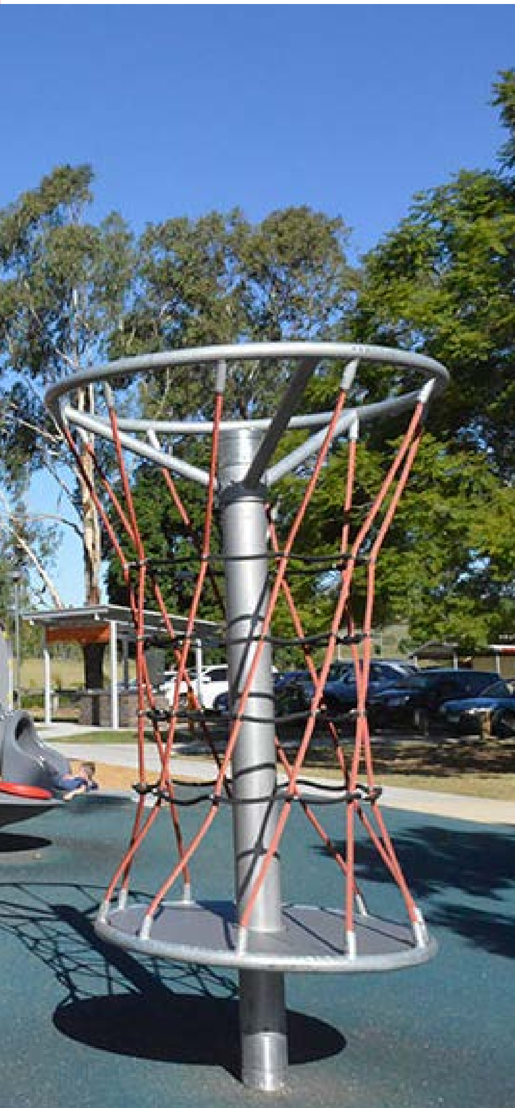
5 2.8m high Corocord Net Twister with activities including climbing and spinning.