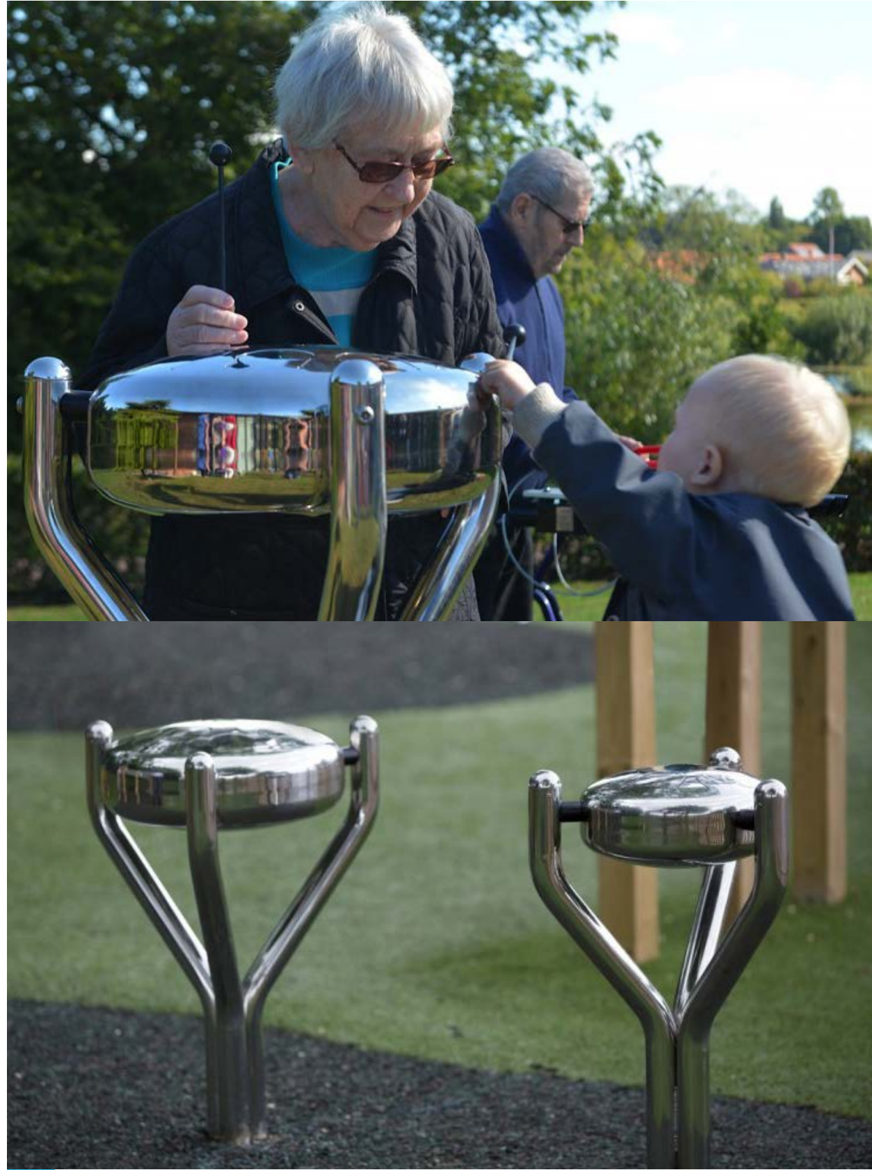
14.12 Example of Drums play item