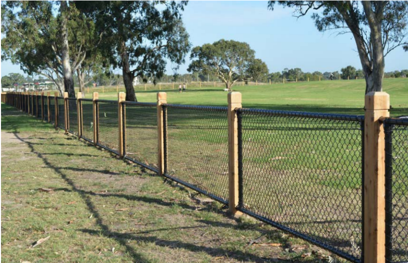
13 Low Safety Fence/Barrier

This drawing and design is subject to copyright and may not be reproduced without prior written consent. Contractor to verify all dimensions on site before commencing work.