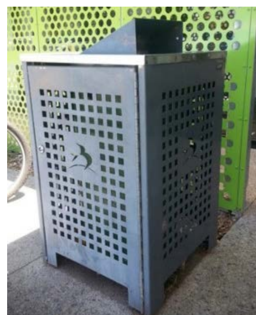
8 Example of 240L Bin Enclosure