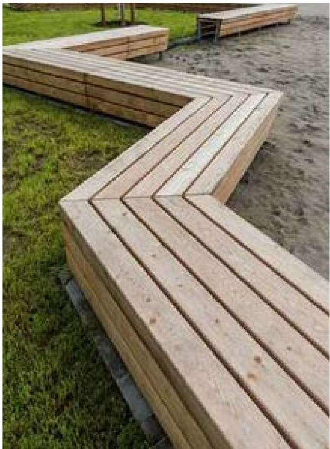
14.5 Custom Timber Bench Seat