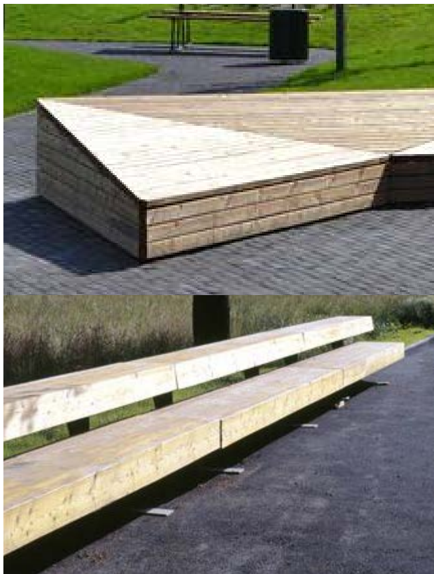
4 Social gathering spaces with custom seating.