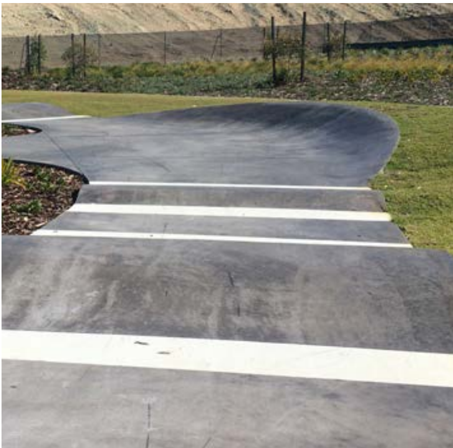
3 Banked corners to scooter/bike track.