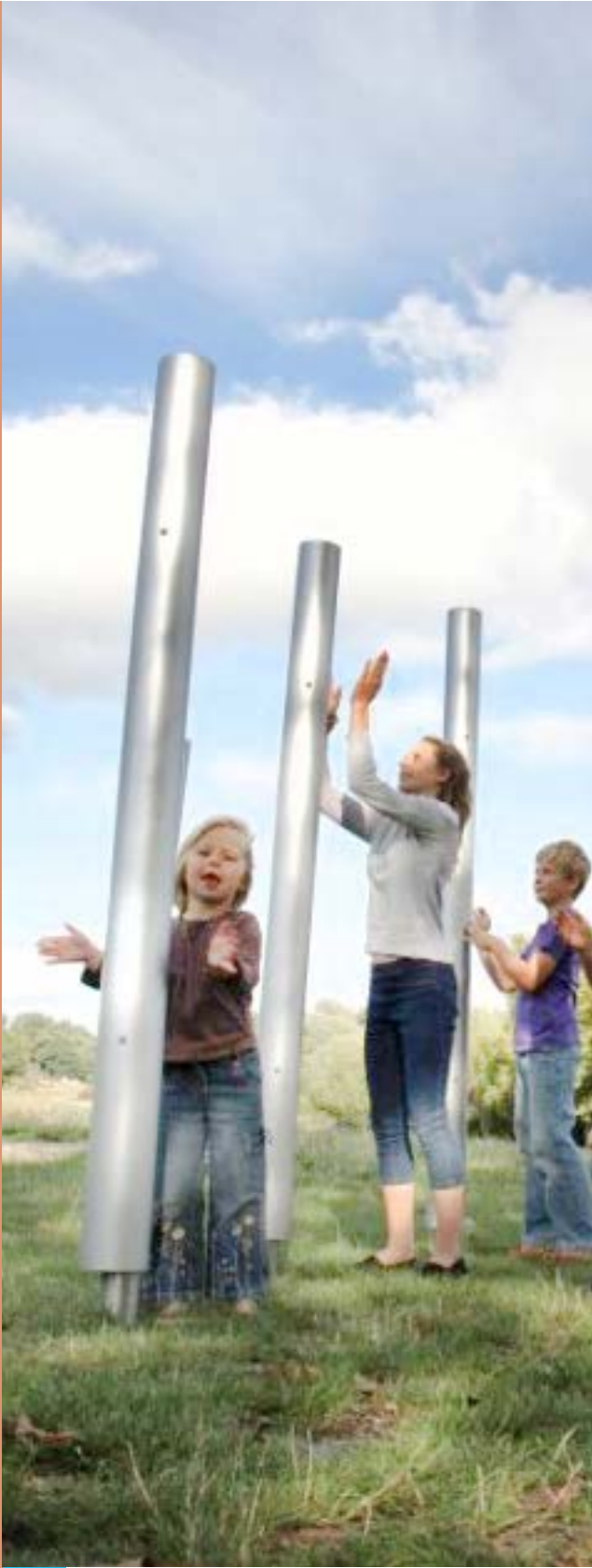
14.11 Example of Chimes play item