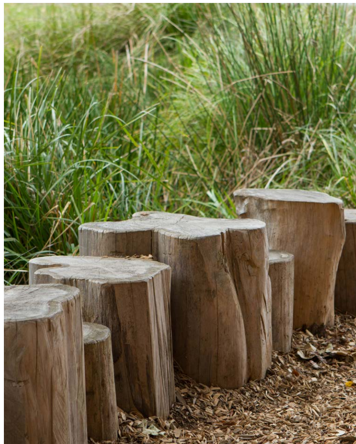
14.6 Natural log steppers at different heights