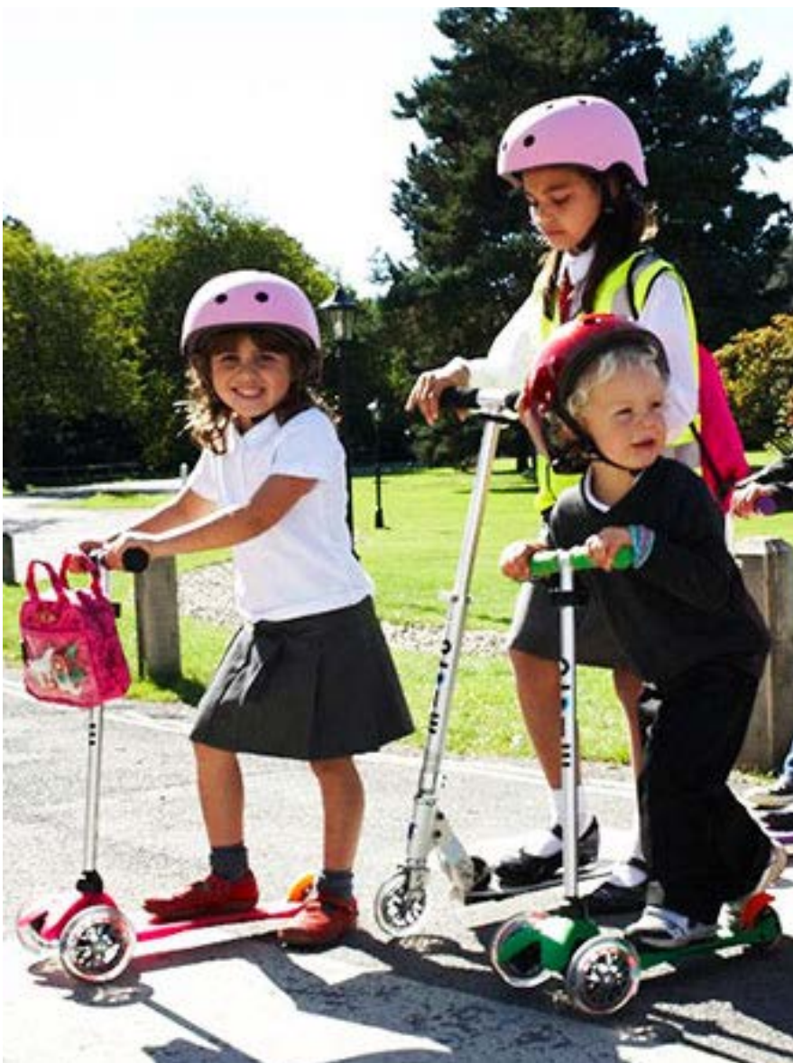
3 Track can accommodate scooters, bikes, skateboards, roller-blading etc.