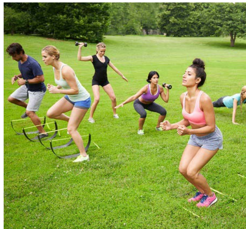
7 Well maintained grass surface for park fitness classes e.g. Boot Camp