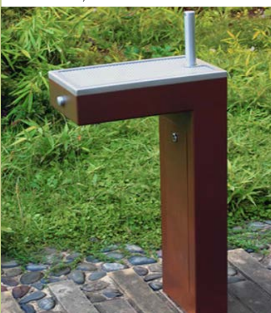
8 Example of accessible drink fountain