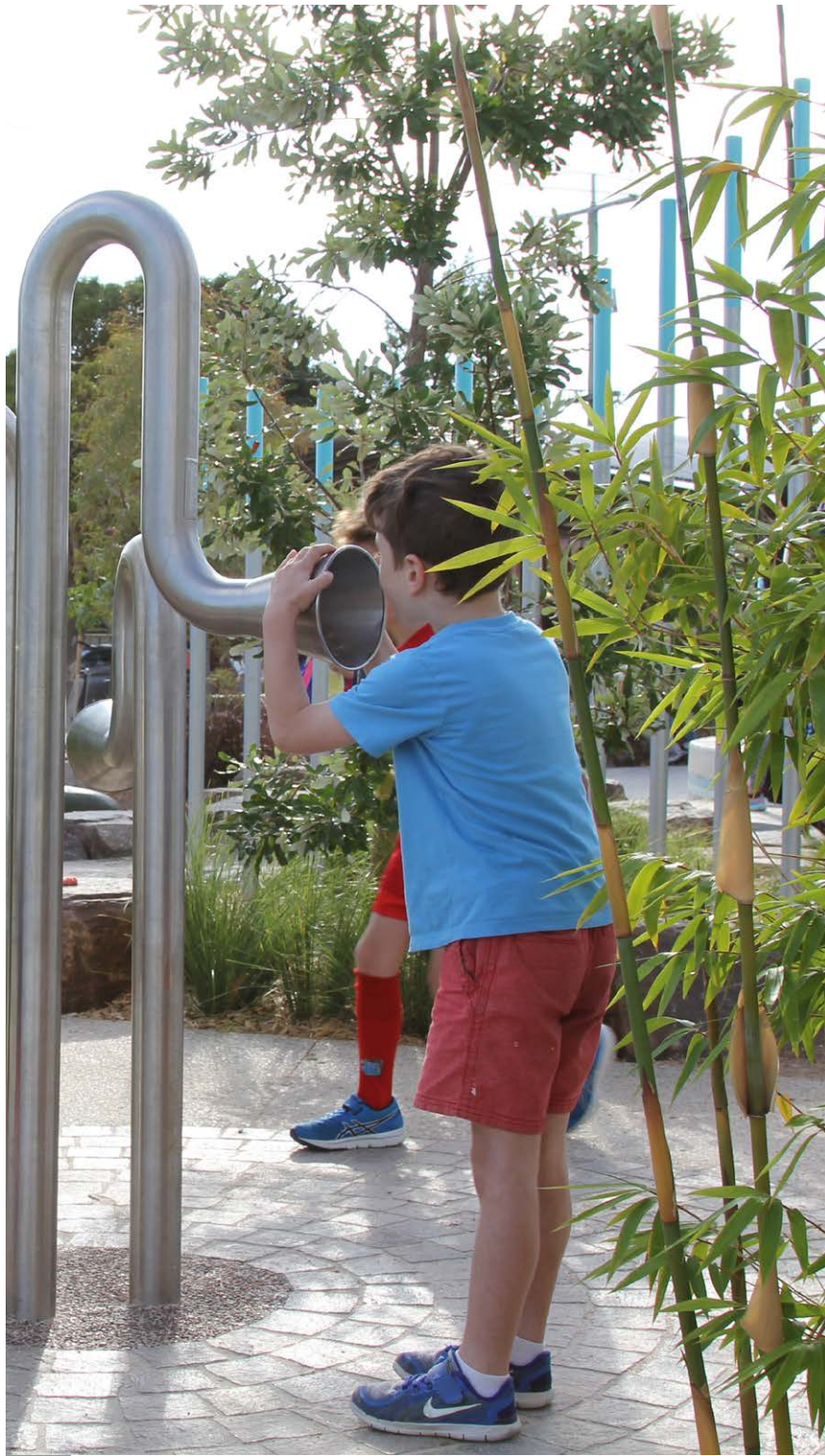
14.14 Example of Talking Tube play item