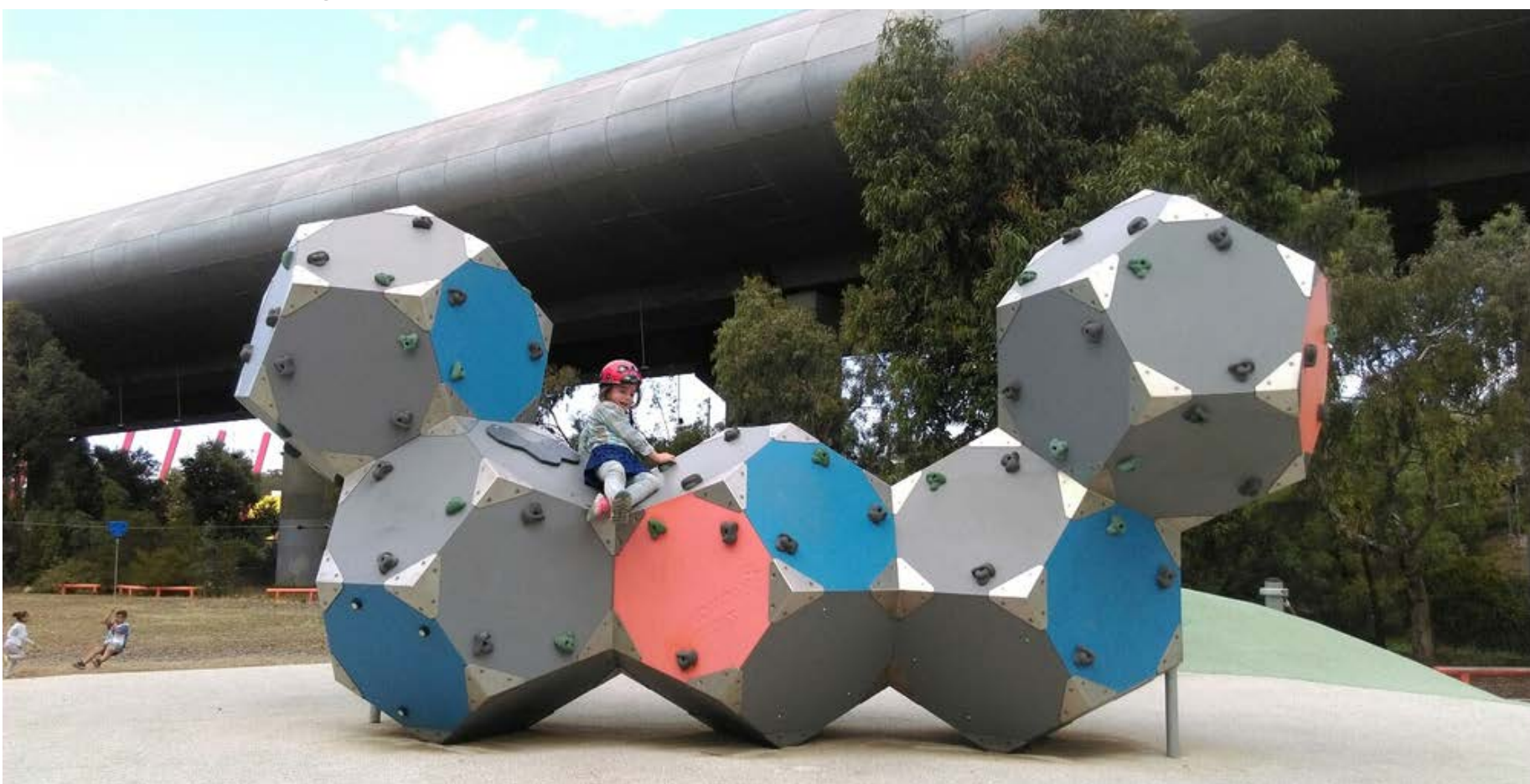
6 3.0m high Bloqx 5 climbing structure to accommodate a large number of users and provides multiple levels of challenging use.