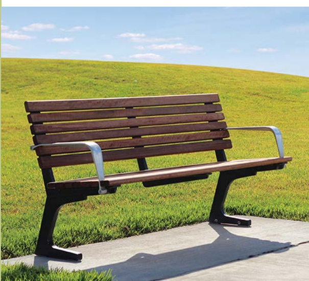
9 Example of seat with back and arm rests.