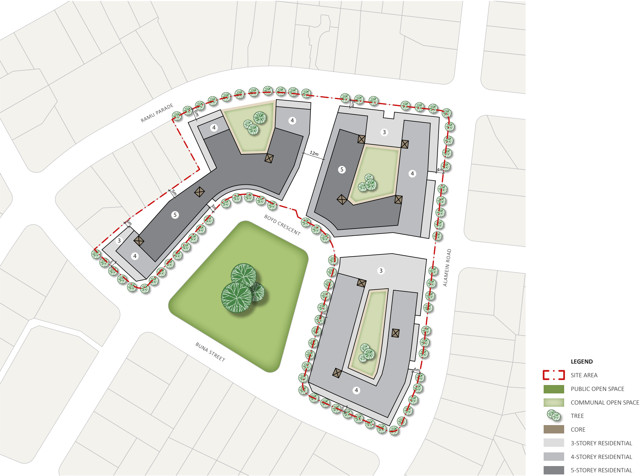
Figure 23 Buna Street Site Concept Plan