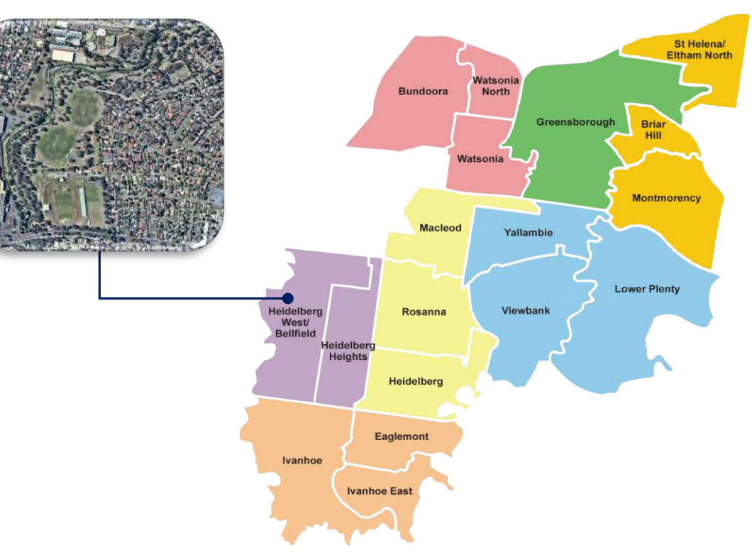
Figure 1: Olympic Park is located in the City of Banyule's West Precinct

The vision for Olympic Park is to provide a place of welcome, and to deliver leisure, recreational and sporting activities for the community in a safe environment.